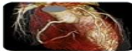
Cardiac Dual Source CT

New: Clinical Benefit of PET/CT Applications