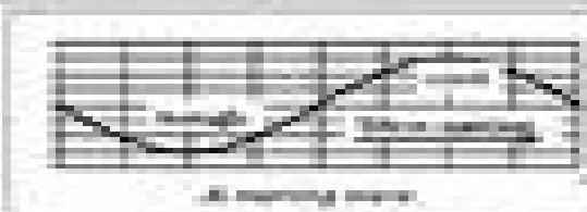
An antinode wave.

The loop is made by waves going in both directions and that gives energy to the wave. Loop supports two nodes each.