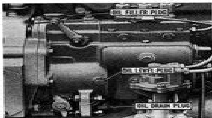
Fig. F0521 — Lubricating oil must be maintained at proper level and be changed at regular intervals on mechanical governor type fuel injection pumps. Drain, fill and oil level plug locations are shown. Refer to paragraph 29.