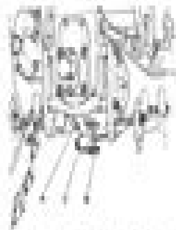
Figure 1000 Tractor with engine, transmission and gearbox (1000 Tractor)

These tractors are the most popular and most used in the world. They are simple and easy to use. They are also very reliable and durable. They are also very easy to maintain and repair. They are also very easy to transport and store. They are also very easy to use in a variety of environments. They are also very easy to use in a variety of environments.